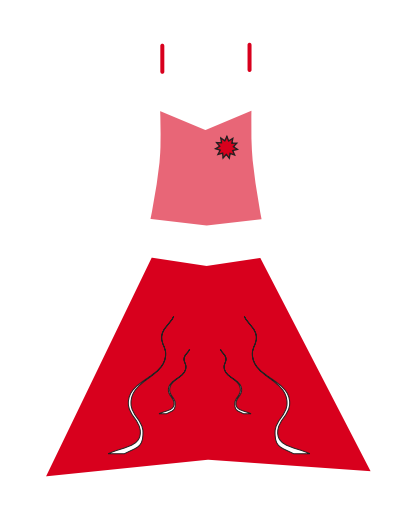
making individual parts of the whole product