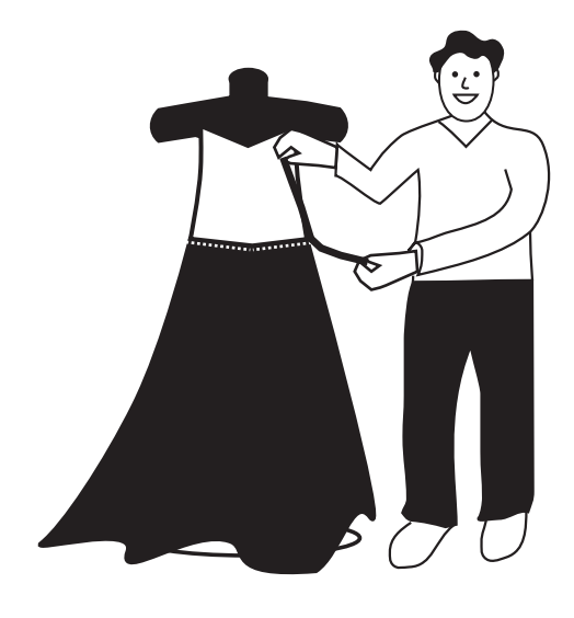
individually (worked by himself)