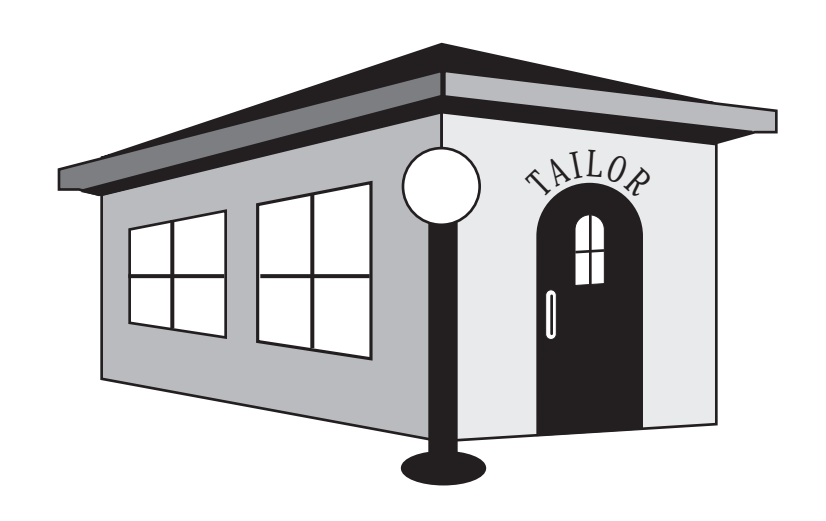
in his own shop