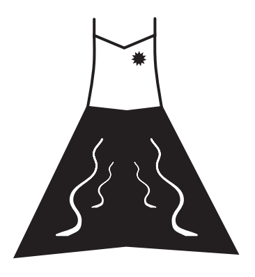
made the whole product