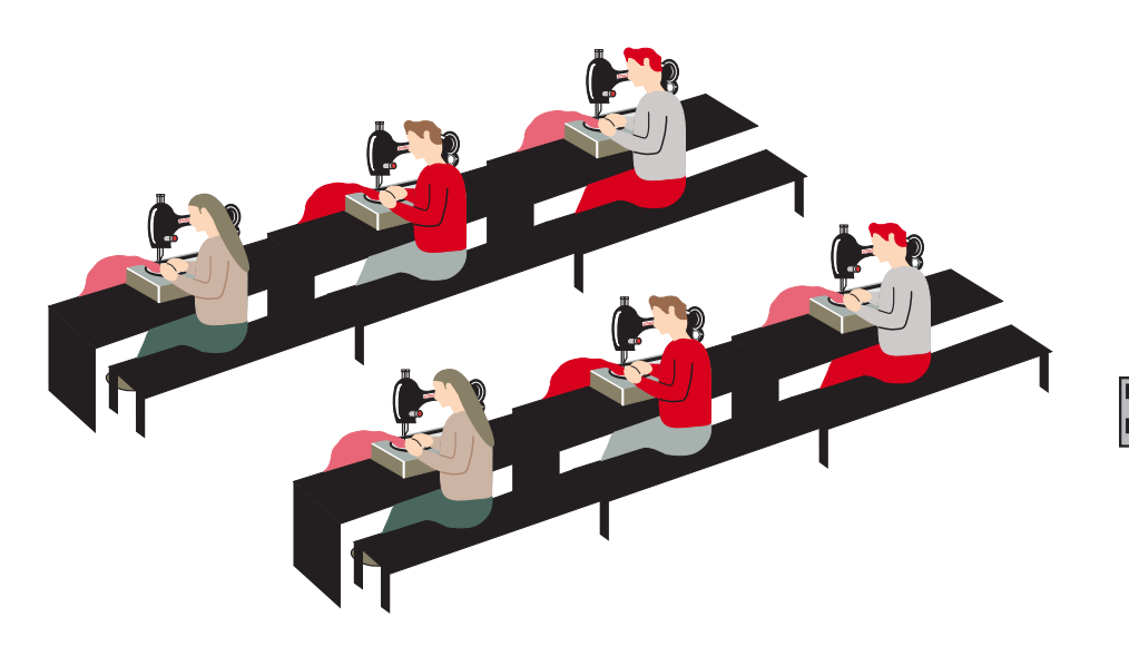
working on assembly lines