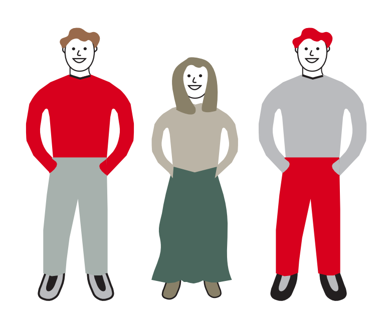
many unskilled workers